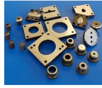
Punches and dies for various types of holes